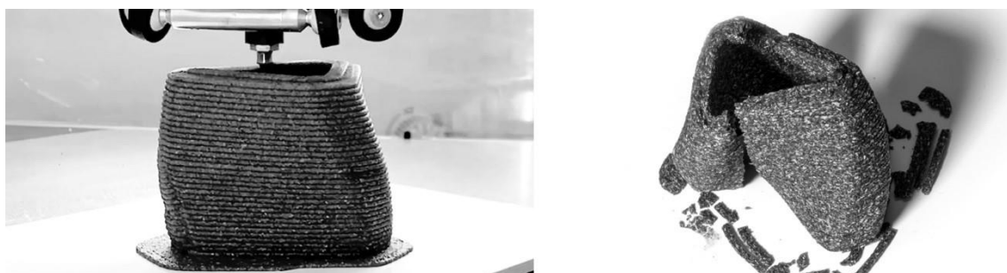
Figure 3: left: LDM TPS print process, right: cured and cracked TPS print (Benjamin Kemper, 2020).

The fabrication research focuses on extrusion systems for 3D printing TPS. Initially, a liquid deposition modeling (LDM) approach was conducted. Therefore, a Delta Wasp 60100 printer with an attached clay extrusion system was converted to deliver liquid TPS to the printing head. The goal was to explore the possibilities of TPS in combination with several additives (such as hemp seeds, fibers, shives, various wood types, eggshells, coffee grounds, and other bio-wastes) to test the printability of the different TPS formulations. The series of experiments clarify factors for LDM printing and additives for TPS. However, this method is not appropriate because of forceful dynamics in the setting process (fig. 3).