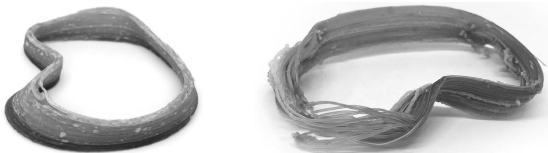
Figure 5: TPS pellet prints (70x100mm), rigid and flexible (Benjamin Kemper, 2021).