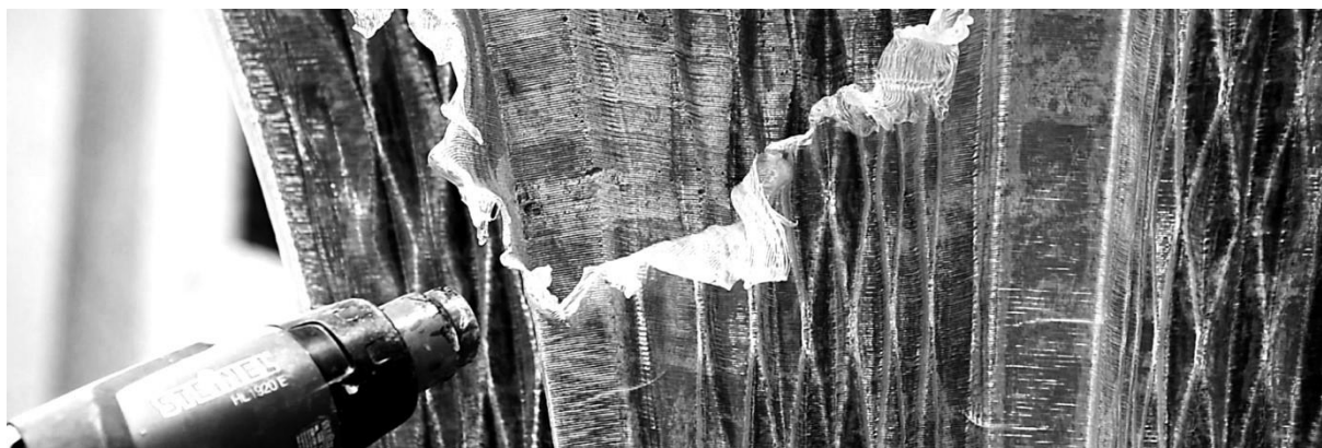
Figure 1: 3D printed plastic formwork (FutureTree, 2017-2019, Gramazio Kohler Research, ETH Zürich).