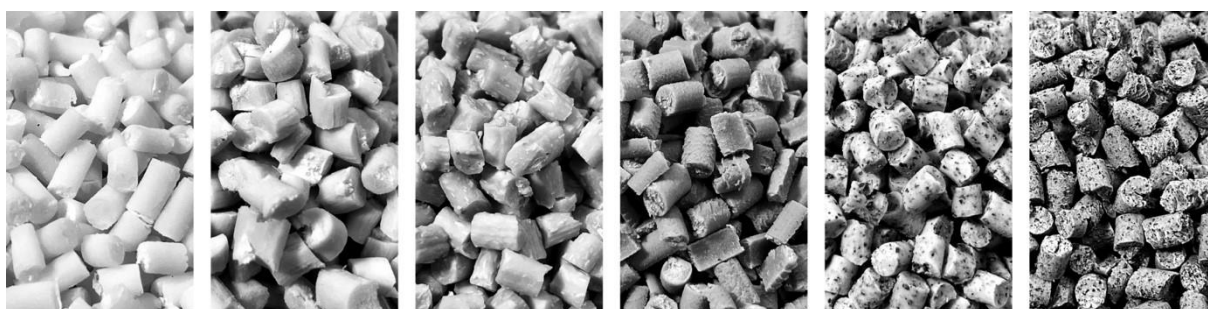
Figure 4: TPS pellets (3-5mm) with additives, from left to right: starch, hemp fibers, hemp shives, bamboo, hemp seeds, coffee grounds (Benjamin Kemper, 2022).

All experiments were conducted on a small scale; further steps are scaling up and working with the related tasks. Questions to answer are the maximum nozzle size, the feed and flow rate, heating temperature and zones, and the layer adhesion.