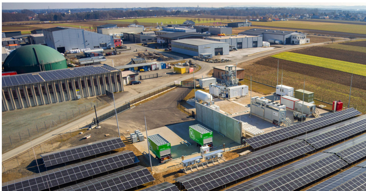
Figure 2. Bird-view of the P2G-site

Parallel to the construction phase a HAZOP-study on the intersections of the individual parts of the plant was undertaken. In the HAZOP process engineers from all involved contractors were involved. The HAZOP study was necessary to supplement the suppliers CE markings, but the issuing of a declaration of conformity by the system operator turned out to be not necessary.