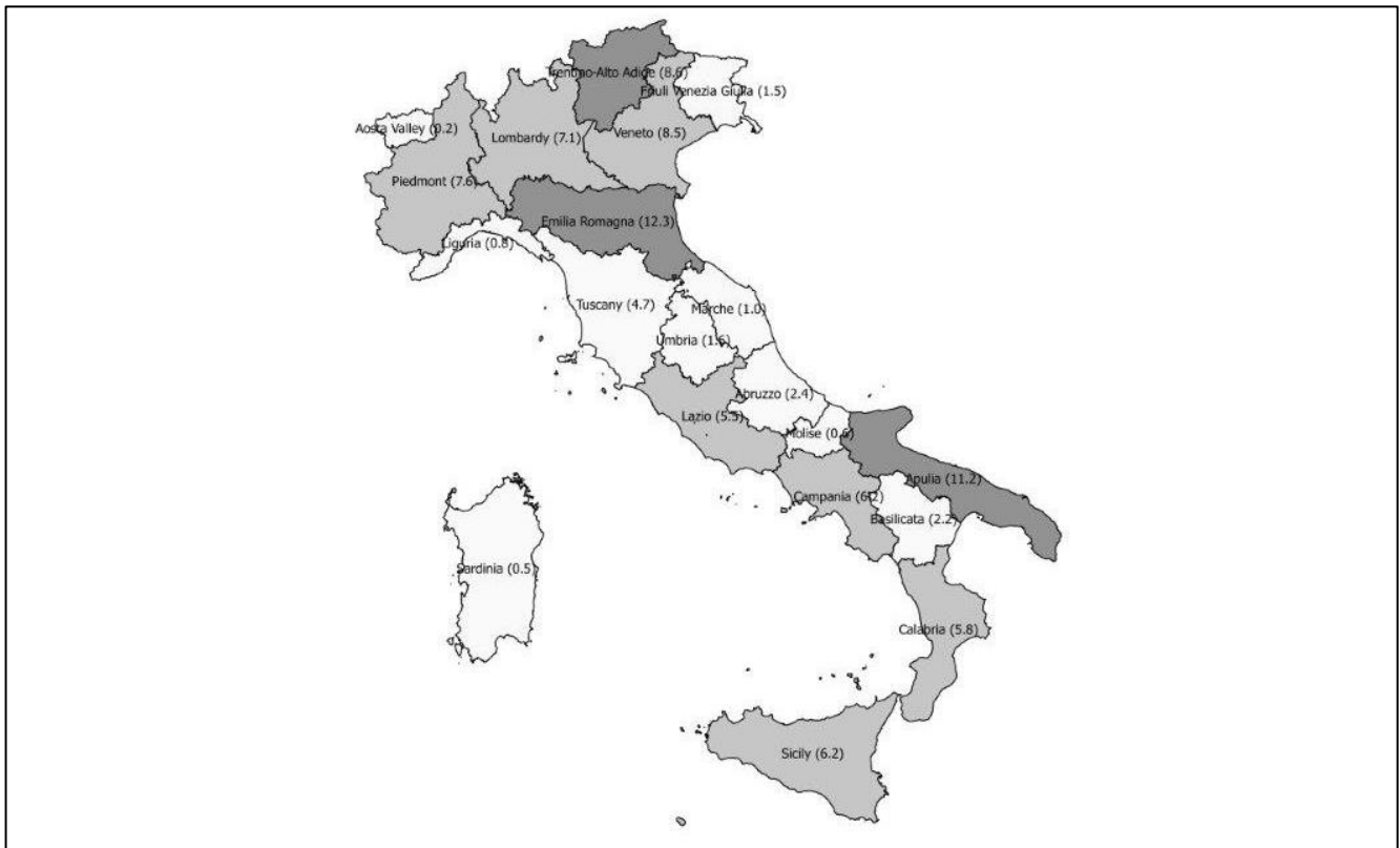
Figure A.1. Share of foreign workers by region in Italy (% on total foreign workers)

The Northern Regions, according to ISTAT classification are: Piedmont; Aosta Valley, Liguria, Lombardy, Trento and Bolzano (Trentino Alto Adige), Veneto, Friuli-Venezia Giulia, Emilia-Romagna. The Central regions are: Tuscany, Umbria, Marche, Lazio. The Southern regions are: Abruzzo, Molise, Campania, Apulia, Basilicata, Calabria, Sicily and Sardinia.