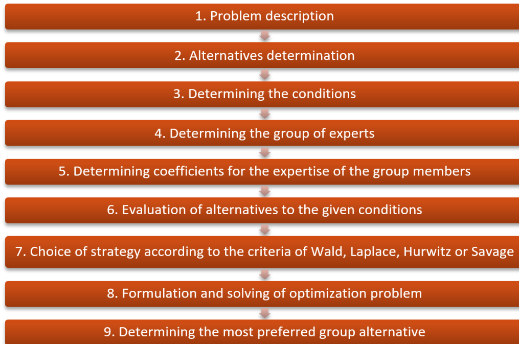
Figure 1. Algorithm for group decision-making under uncertainty conditions.

The proposed decision-making algorithm for evaluation considering different criteria to cope with uncertainty conditions is shown in Fig. 1.