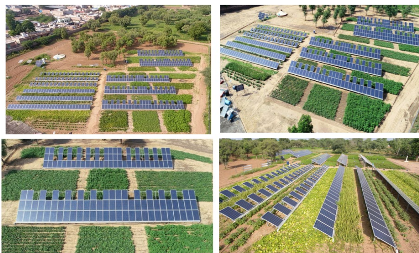
Fig.2. Field view of different crops grown in agri-voltaic system during Kharif , 2021

Within the AVS framework, crops such as mung bean ( Vigna radiata ), moth bean ( Vigna aconitifolia ), and cluster bean ( Cyamopsis tetragonoloba ) are cultivated during the Kharif season in the interspace between two PV arrays. Additionally, during the Rabi season, irrigated cultivation includes Isabgol ( Plantago ovata ), cumin ( Cuminum cyminum ), and chickpea ( Cicer arietinum ). Beyond conventional arable crops, perennial components such as medicinal plants like aloe ( Aloe vera ) and brinjal ( Solanum melongena ) are grown in the interspace areas of AVS-1 and AVS-2. Vegetable crops like spinach ( Spinacia oleracea ) and snap melon ( Cucumis melo L. Momordica group) are incorporated as annual components in the AVS system. These strategically selected crops are hypothesized to induce microclimate modifications beneath the PV modules, leading to temperature reduction and consequently optimizing PV-based electricity generation. A visual depiction of various Kharif crops cultivated within the AVS is presented in Figure 2.