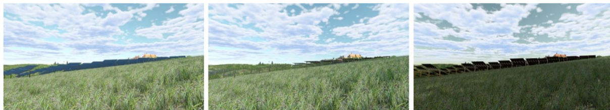
Figure 3. A tracker AV modell that follows the sun by changing date and time parameters (left: morning, middle: midday, right: evening)

Figure 2 shows the overall achievable quality of the visualisations in Godot. By using complex vegetation systems (attached to the land cover classes derived from geodata), high-quality textures that support reflections, roughness, and physical models for atmospheric effects, high quality can be achieved to evaluate the visual impact of AV installations using immersive VR technologies. In addition, real-time changes for date and time allow evaluation under different lighting conditions. This also enables dynamic shadow effects, reflections or tracker positions.