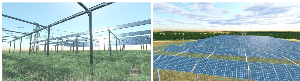
Figure 2. Visualisation of an overhead AV installation over a grain culture (left: first-person-view, right: overview).

Although there is a range of different game engines for the creation of interactive 3D models, the import of geodata is hardly or only very rudimentary implemented in these systems. In addition, many systems are proprietary and can entail high licensing costs. Game engines are of particular importance for large-scale and interactive 3D visualisations in different fields, and there are several commercial products (e.g., Cry Engine, Unity) available [15][16]. We decided to use the open-source game engine Godot as initial tests with geodata processing have shown that this engine is very well suited for creating large-scale visualisations in terms of the degree of realism, performance and display options such as VR or AR.